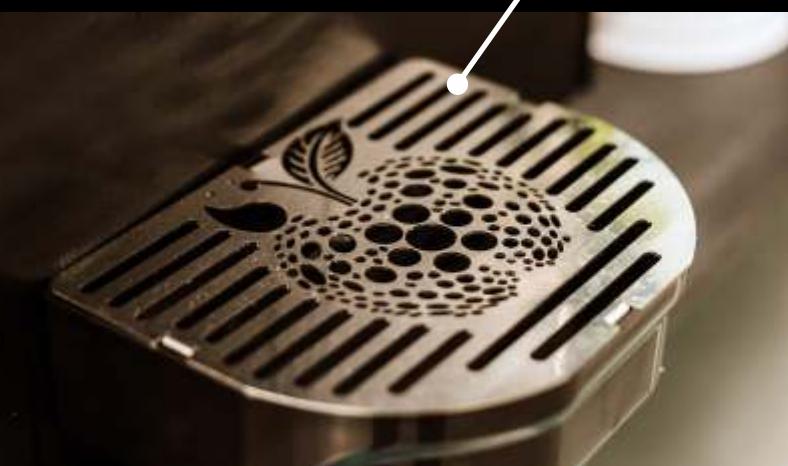
COMBINATION OF FUNCTIONALITY AND AESTHETICS